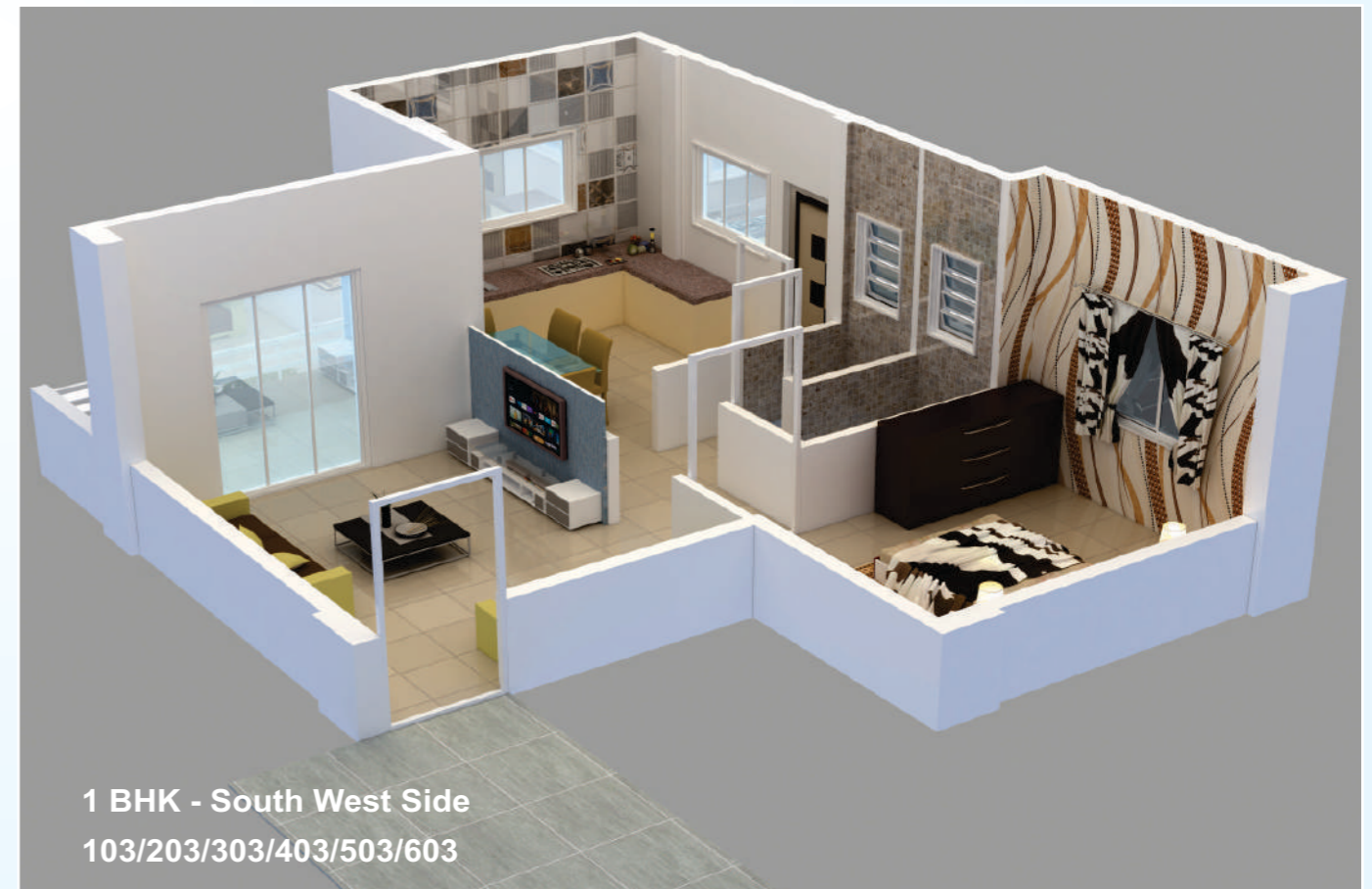
1 BHK - South West Side 103/203/303/403/503/603