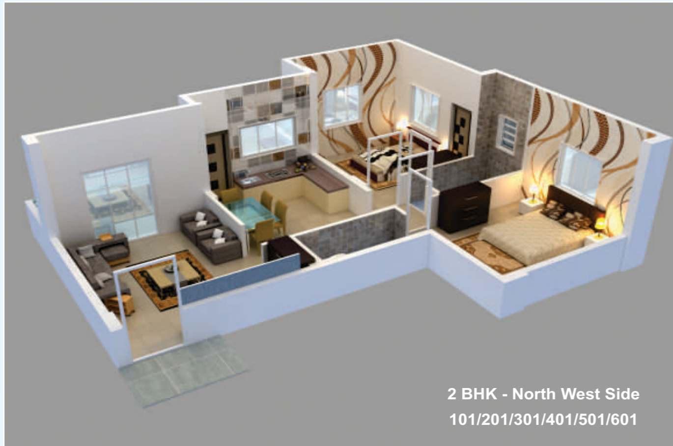
2 BHK - North West Side 101/201/301/401/501/601