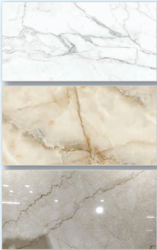
2'x4' Flooring Tiles in Living