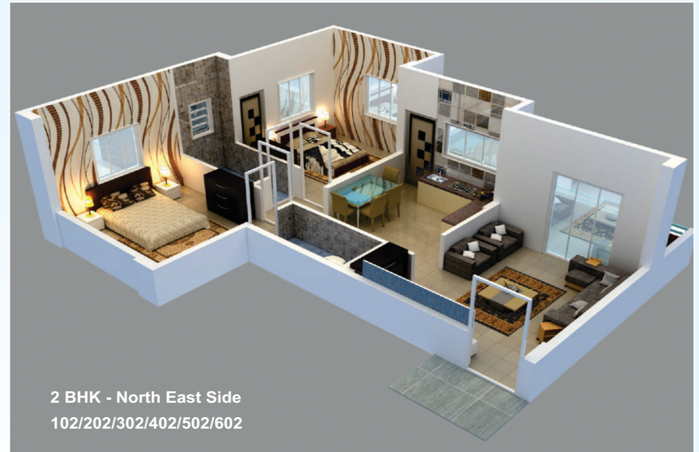
2 BHK - North East Side 102/202/302/402/502/602