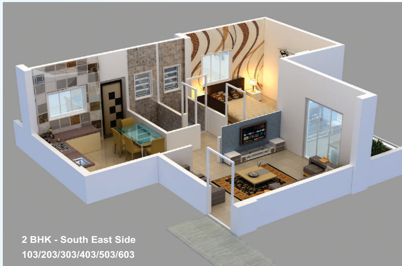
2 BHK - South East Side 103/203/303/403/503/603