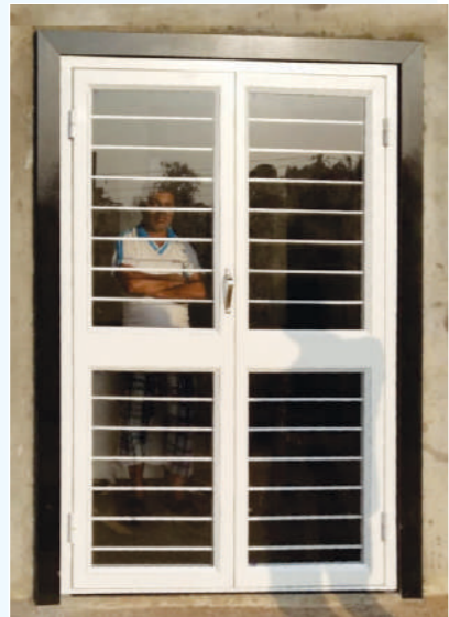
French Door in Living