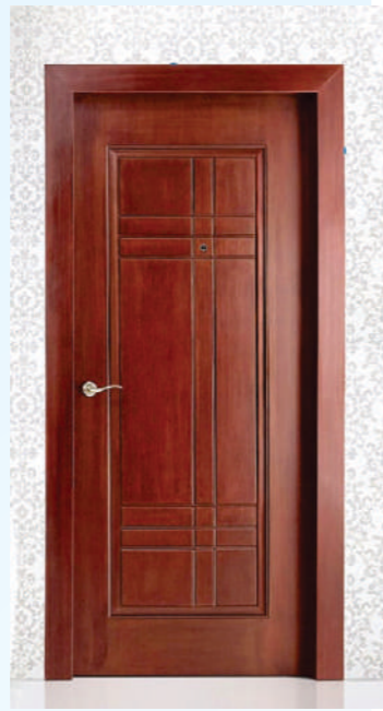
Main Entrance Door